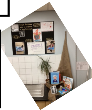
We compare Ernest Shackleton's ship to modern ice breaker ships.