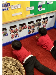
Recalling special events in school